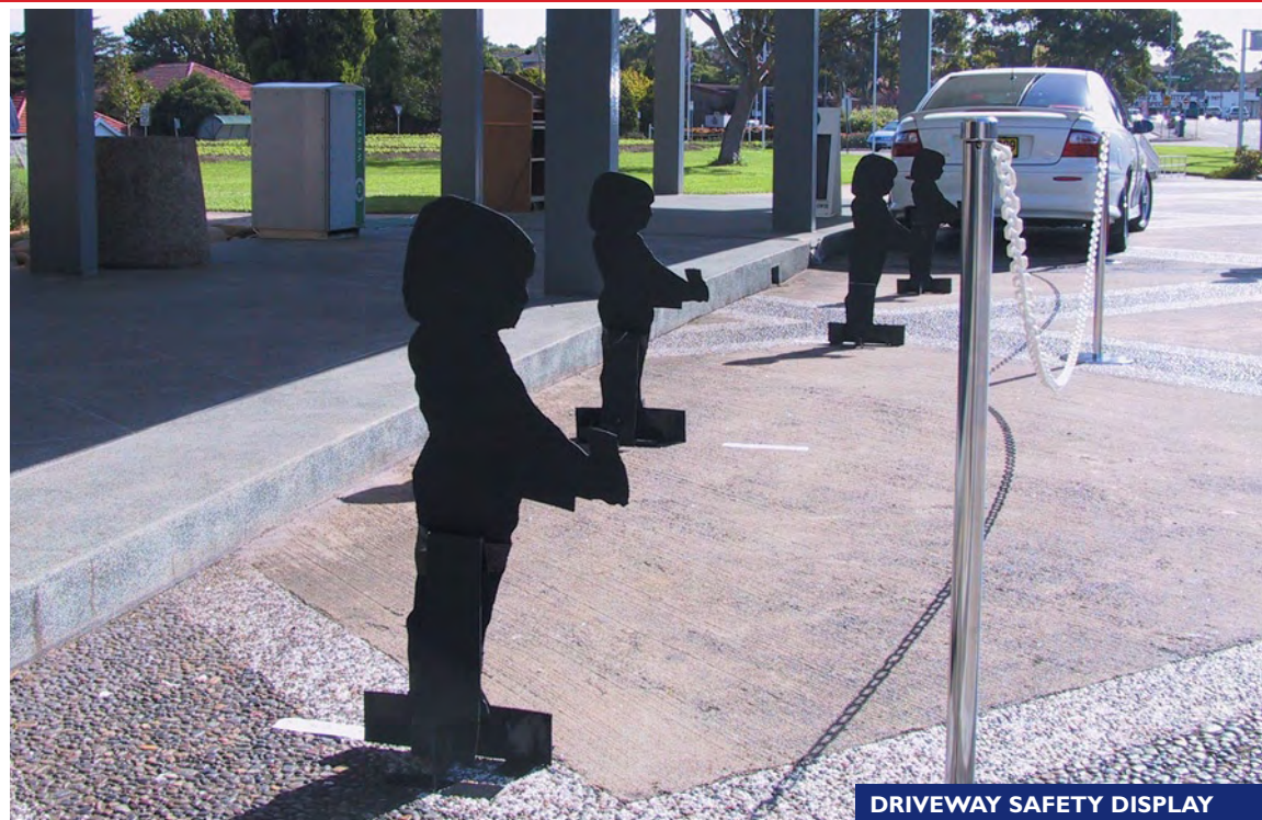
DRIVEWAY SAFETY DISPLAY

Many of the drivers who have participated in the display say that they cannot see the first three toddler sized figures ( pictured at right ).