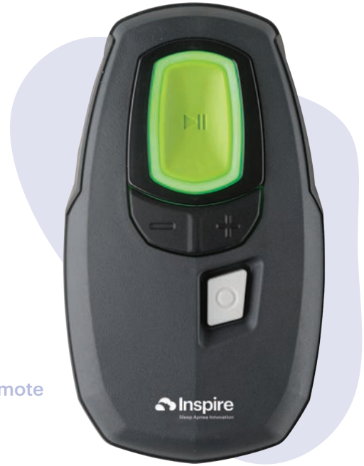
Inspire Sleep Remote

Inspire works inside your body while you sleep. It's a small device placed during a same-day, outpatient procedure. When you're ready for bed, simply click the remote to turn Inspire on. While you sleep, Inspire opens your airway, allowing you to breathe normally and sleep peacefully.